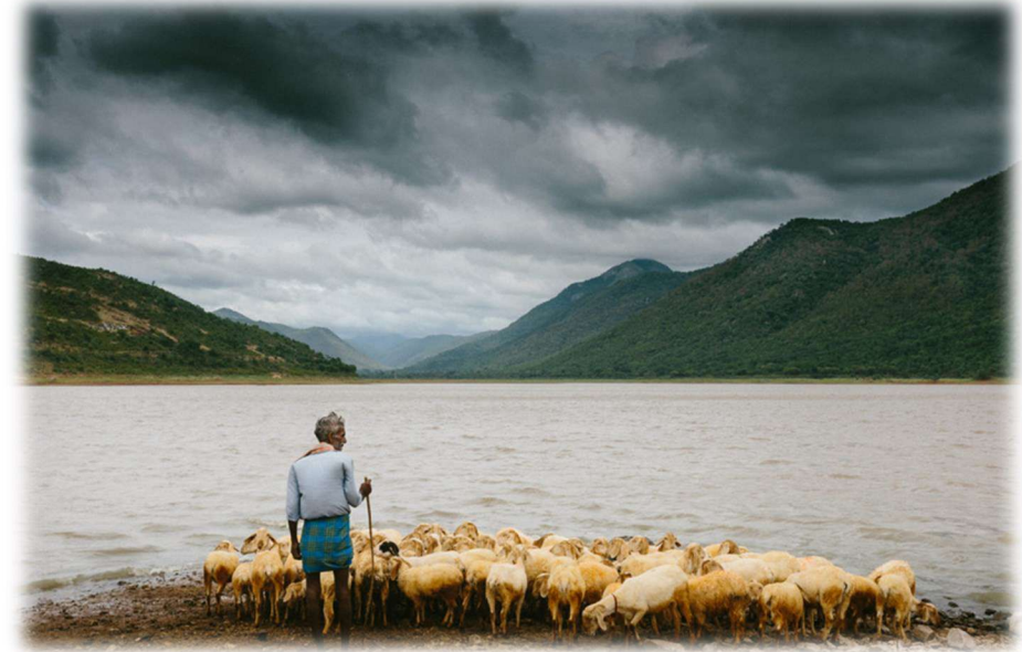
"The Shepherd"

The selection in Acts is a continuation of the same story from last Sunday. Peter and John, after healing a man who used to beg at the temple gate, and after speaking to the people at Solomon's Portico on the east side of the temple after that miracle, were arrested and held until the next day. They came before the high priest and his family and questioned them about the healing miracle. Peter, filled with the Holy Spirit, spoke to all assembled, recognizing that he and John were arrested because they did something good. He answered their question about the power behind the miracle: the man who used to beg stood before them was healed by the name of Jesus Christ, the one crucified and now raised from the dead.