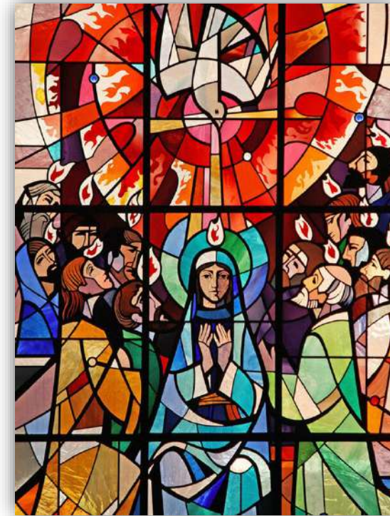
A modern stained glass window from St Aloysius' church in Somers Town, London of the Holy Spirit descending on Our Lady and the apostles, as is recounted in Acts 2:1-11.

A community of faith responding to God's call. Loving, learning and leading people to Jesus Christ.